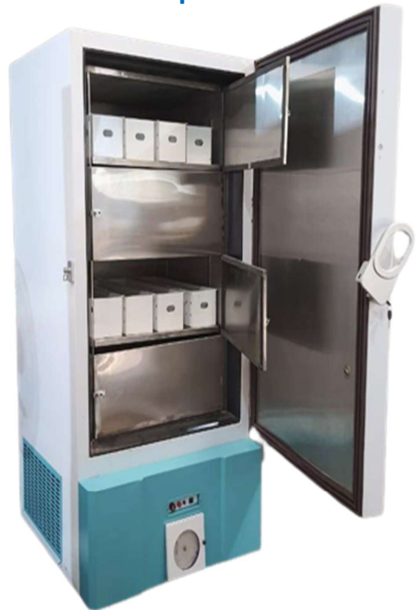
Make: MarkEn Model: MDFU-7